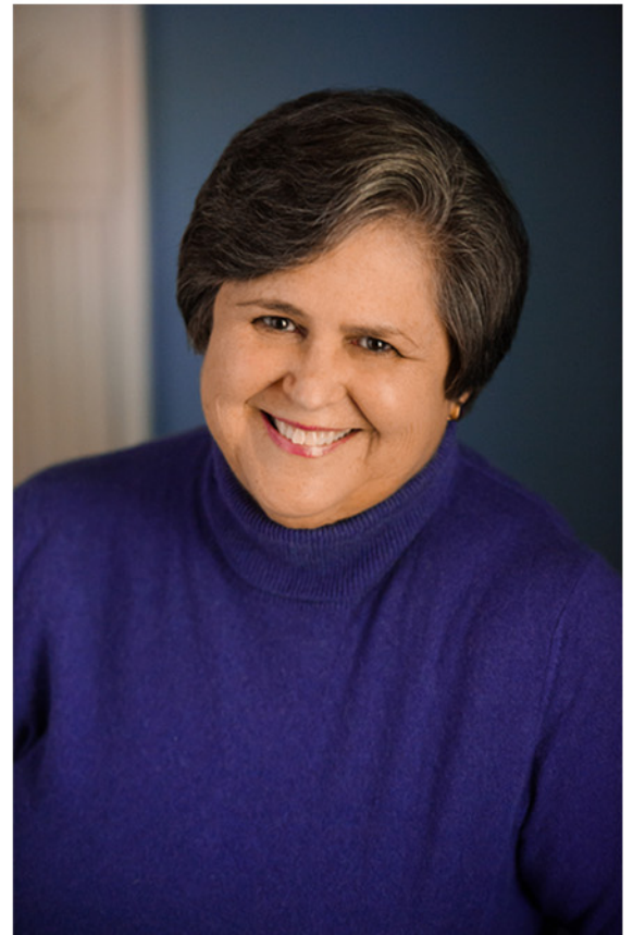
Download hi-res head shot